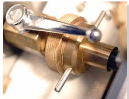
Vacuum lens assembly