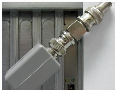
An Arcnet card in rear of PLC