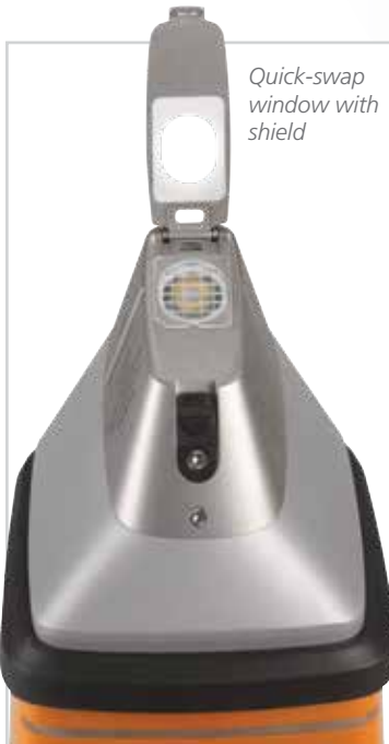
Quick-swap window with shield